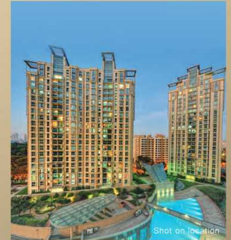
Vasant Lawns (Thane West)