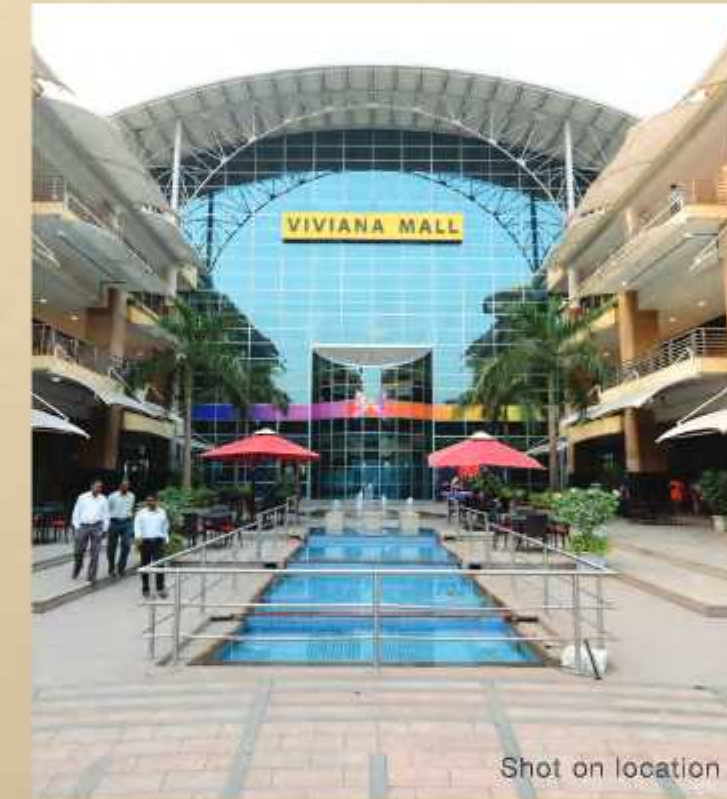
Viviana Mall (Thane West)